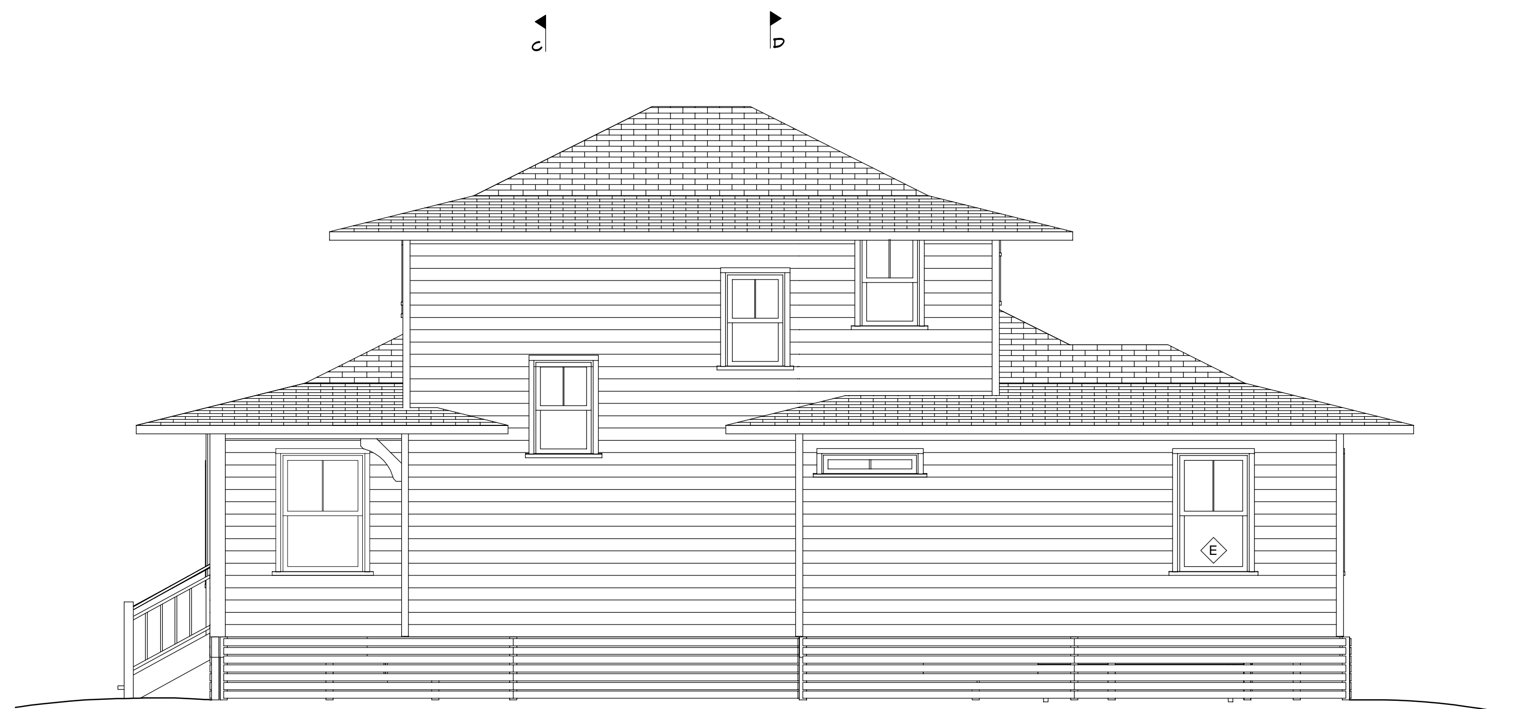
4 N RIGHT ELEVATION A-4 SCALE: 1/4" = 1'-0"

JOHNSTON • CASSEL DESIGN STUDIO 71 BALDWIN AVE., B-6 P.O. BOX 790731 PAIA, MAUI, HI 96779 (808) 579-9778 PHONE (808) 579-9778 FAX info@johnstonscassel.com info@johnstonscassel.com